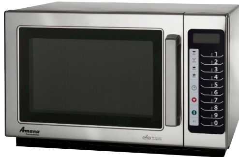
Model RCS10TS shown